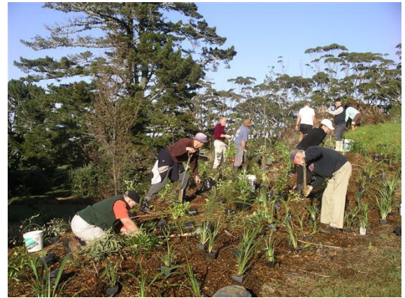
Keen volunteers planting the Kowhai Rd restoration site in June 09

This winter has been busy again for Centennial Park volunteers. Our major planting programme is the highly visible area on Kowhai Rd. This was a joint venture, with golf club assisting with mulch spreading, council supplying most of the plants and volunteers providing the sweat. The other main site is near the golf course 15 th tee -- where tradescantia, acmena, privet and giant reed were controlled. Several other sites were planted including Centennial Place and the Aberdeen track. Much time has been spent on track maintenance with volunteers spreading about five metres of track metal and ensuring tracks are well drained. Volunteers have worked more than 1600 hours in Centennial Park this year already, most of which is spent on weed control. A detailed summary of completed work can be found in the annual report on our website.