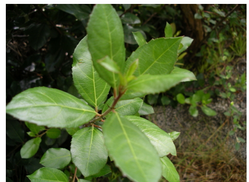
Rhamnus must go, before it is too late for the bush

Rhamnus, or evergreen buckthorn, is a big worry. It is a rapidly growing weed tree which you probably wouldn't recognise as a weed. DOC spends thousands of dollars a year trying to control it on Rangitoto Island. Unfortunately it is becoming widespread in properties in Campbells Bay and CPBS would like to get rid of it. One way of doing this is through the ARC's Community Initiatives Programme. This programme helps participants define an area, obtain landowner support, and then -- with hard work and possibly some outside funding -- begin to eliminate the weed from this area. Bush Society volunteers may contact you for your support to help get rid of this nasty plant.